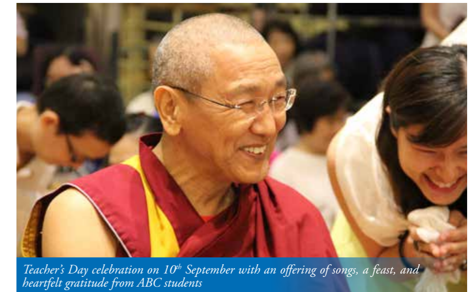
Teacher’s Day celebration on 10 th September with an offering of songs, a feast, and heartfelt gratitude from ABC students